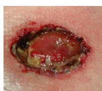
Stomal dehiscence & retraction

i) improved methods of stoma formation to prevent complications and improve quality of life.